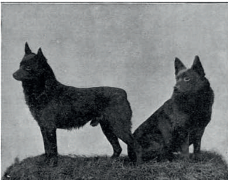
Fig. 115. - Typical Schipperkes.

"This faithful little dog, frequently met with on our barges and canal-boats, is characterised by great intelligence. By his fidelity, vigilance, obedience, and good temper with children, his graceful and elegant shape and carriage, and his perfect cleanliness, he has become the favourite dog for the house. He has also a great fancy for the company of horses, and on this account was formerly employed as a watch-dog on coaches, diligences, and carts, where, sitting proud, attentive, and fierce, on the front or highest part of the vehicle, he seemed more at home than in any other position. He is a veritable demon at such vermin as mice, rats, etc."