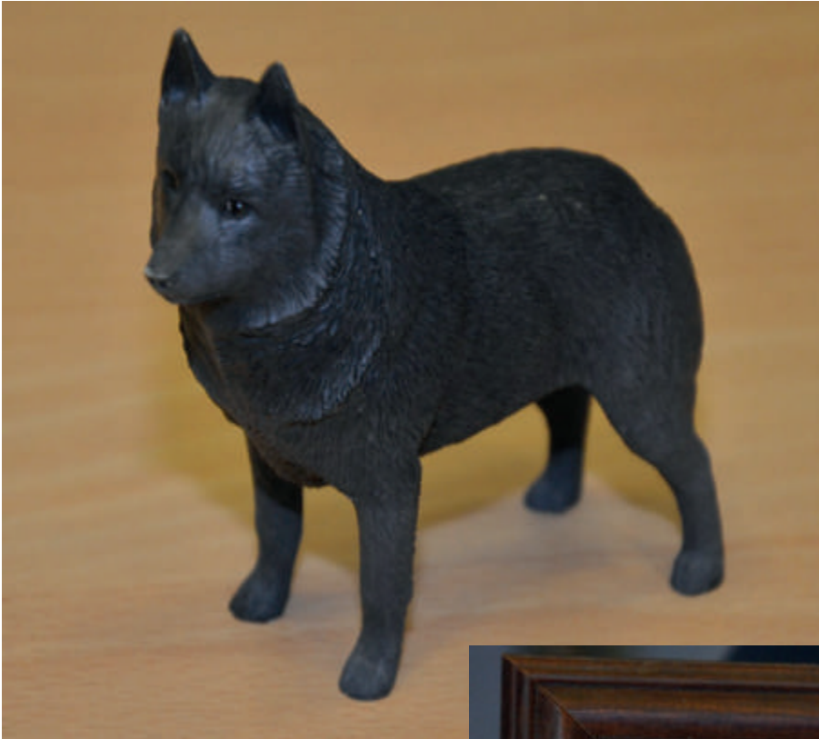
Northlight model Reserve £20

Bids can be sent to the Hon Secretary in advance. BYQUY, 27 Stow Road, Stow-cum-Quy, Cambridge CB25 9AD