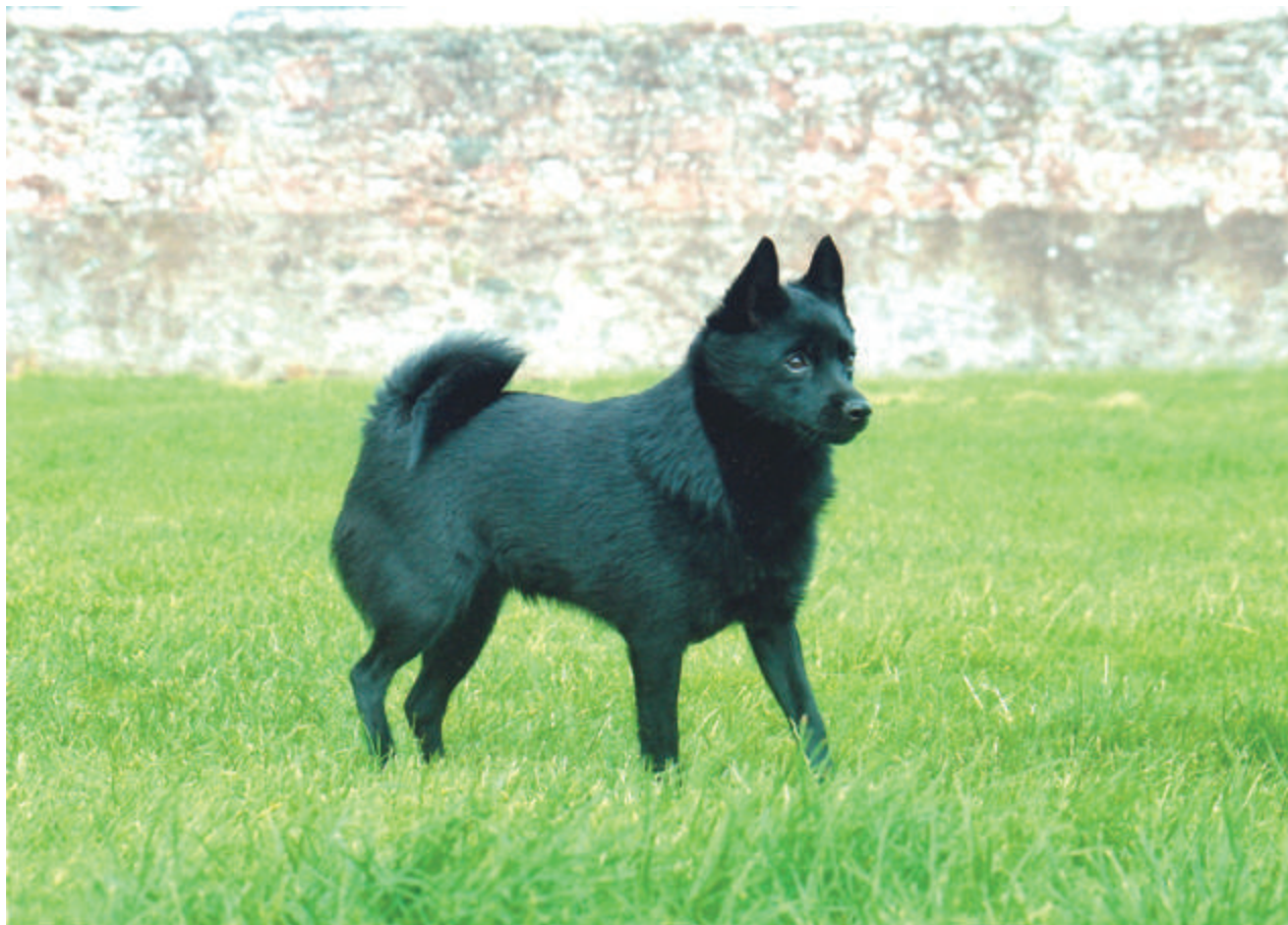
ABYLITY NINA'S CELTIC QUEEN OF TURNLAW (IMP) . Aged 17 months.

It is great to be back in the ring again after more than 25 years and we have had marvellous fun since Nina exploded in to my life. A great-great grand-daughter of CH. and INT CH. TURNLAW TATTIE BOGLE WITH RADASH (Top Sire 1999), she has been a consistent winner at the relatively few CH shows we have attended. Highlights include: