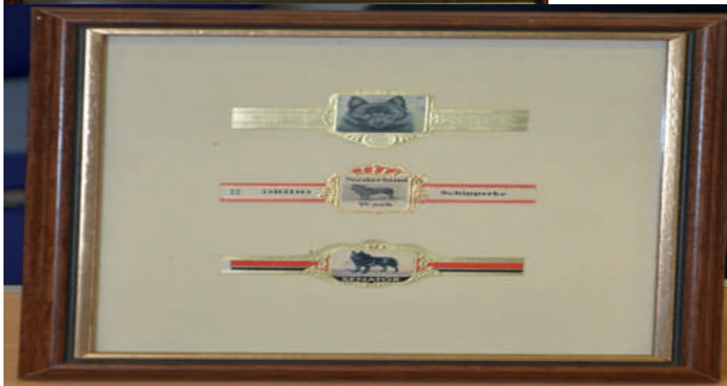
Schipperkes on Cigar Wrappers Reserve £15