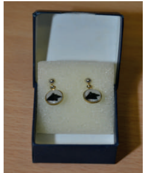
Schipperke Earrings Reserve £10