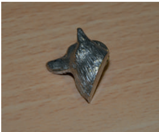
Schipperke Head Reserve £10