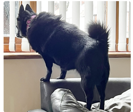
Top: Blue remembers his way back to where the tasty sausage came from, but can't quite understand why the door won't open. Above: Lilly on duty.

“Schipperkes are good communicators. My boy tells me that the water bowl is empty by scratching in it, and then, if no one takes any notice, he lifts it up and throws it on the floor!”